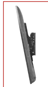
+15°/-5° of tilt for versatile viewing angles